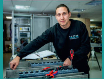
Individual further education & development