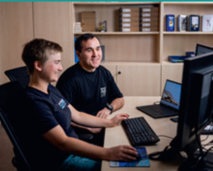
Short distances instead of lots of bureaucracy