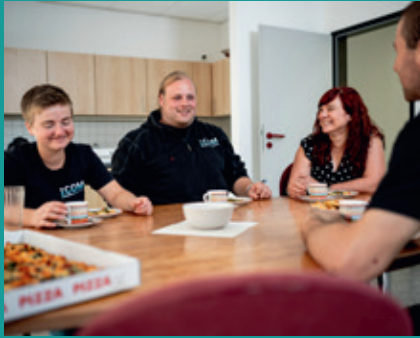
A family atmosphere