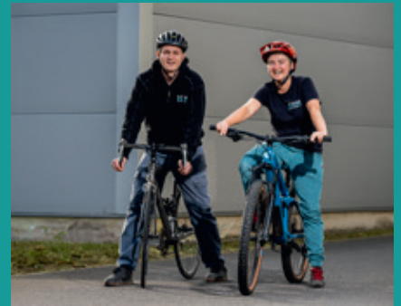
Numerous additional benefits