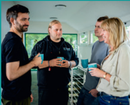
consideration for private matters